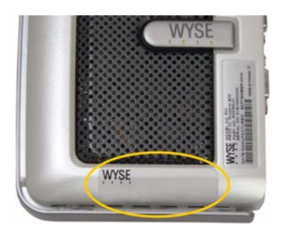
Figure 7 Placement of Wyse Conversion Label

Failure to install the label may cause delays in service and support. The serial number must be given to a Customer Support Technician to validate entitlement to support and service from Wyse. Failure to do so will result in the original operating system being loaded on the device and is in breach of your license agreement.